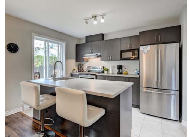
Lemieux 11 - Apt #5 - 02