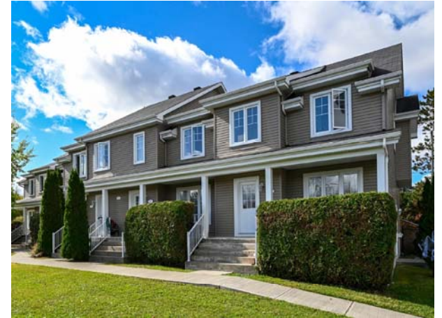
Lemieux 11 - 06