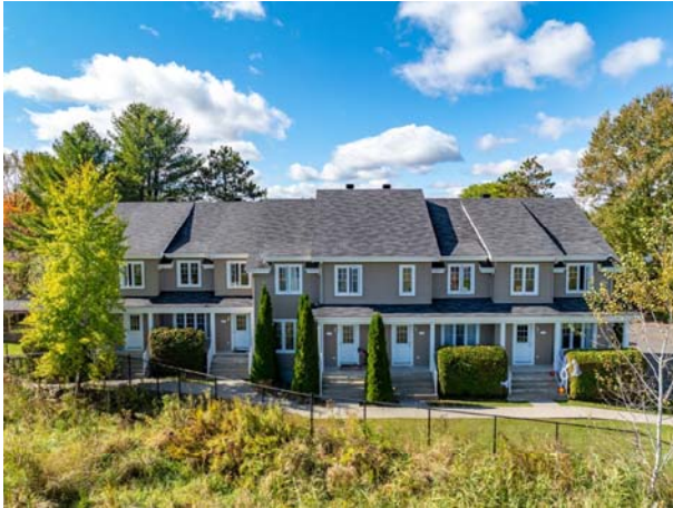
Lemieux 11 - 04