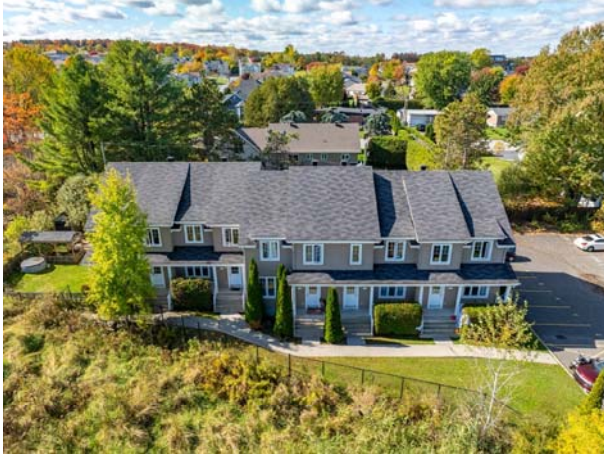
Lemieux 11 - 01