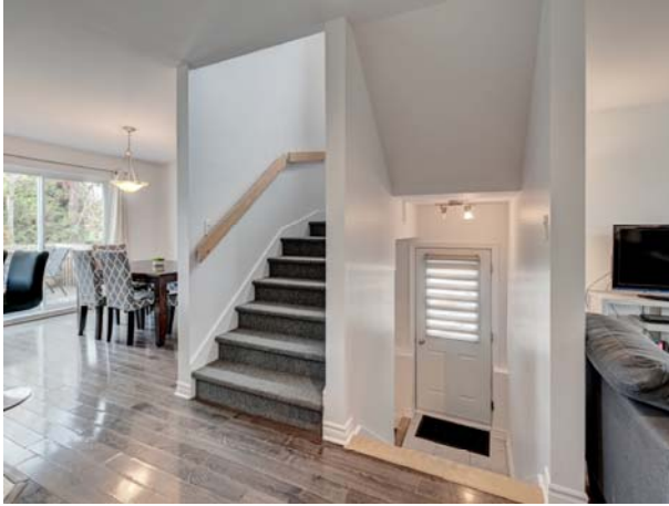
Lemieux 11 - Apt #1 - 03