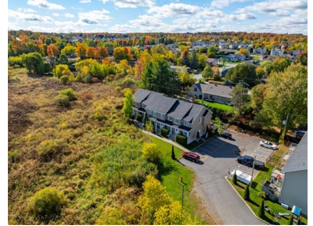
Lemieux 11 - 03