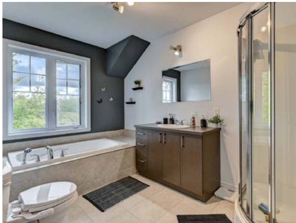
Lemieux 11 - Apt #5 - 04