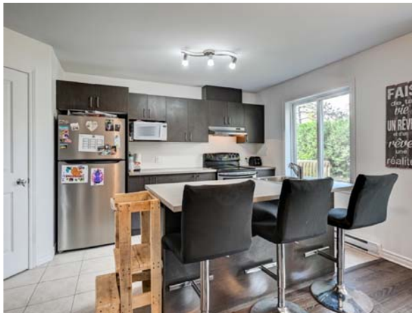
Lemieux 11 - Apt #1 - 01