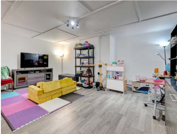
Lemieux 11 - Apt #1 - 06