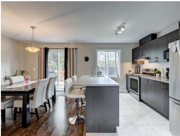
Lemieux 11 - Apt #5 - 03