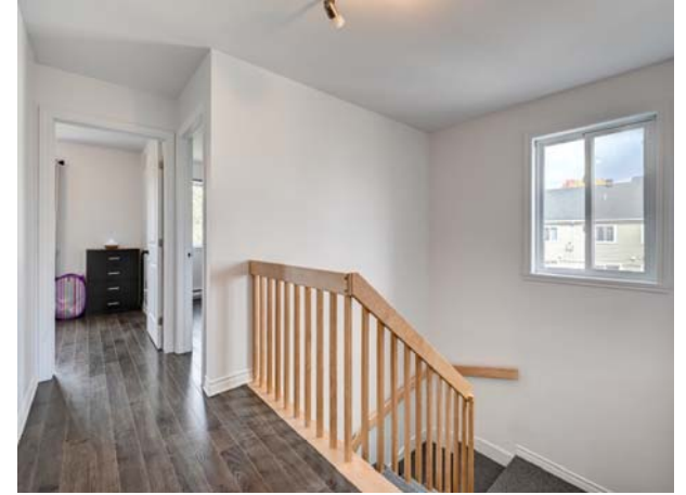
Lemieux 11 - Apt #1 - 05