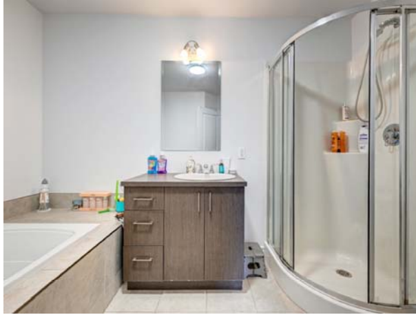
Lemieux 11 - Apt #1 - 04