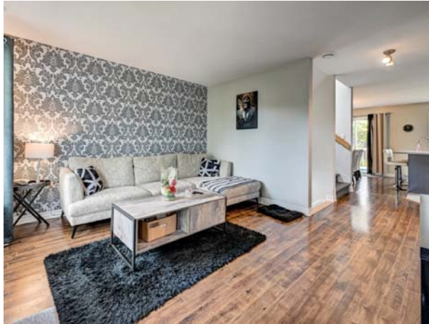
Lemieux 11 - Apt #5 - 01