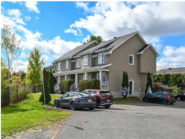
Lemieux 11 - 07