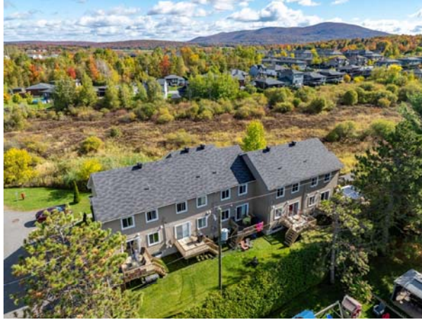
Lemieux 11 - 02