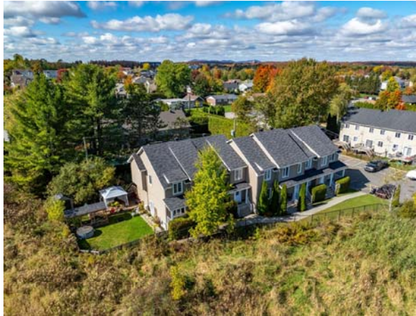
Lemieux 11 - 05