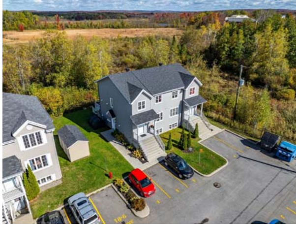
Lemieux 16 - 02