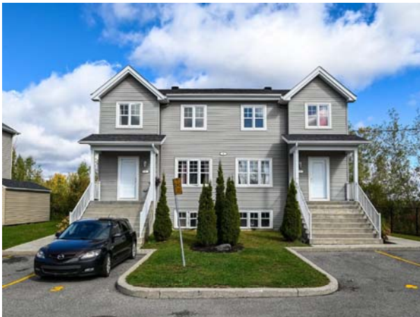
Lemieux 16 - 07