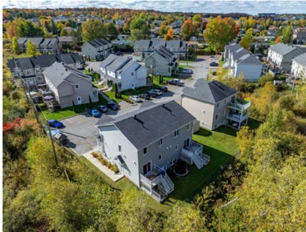
Lemieux 16 - 05