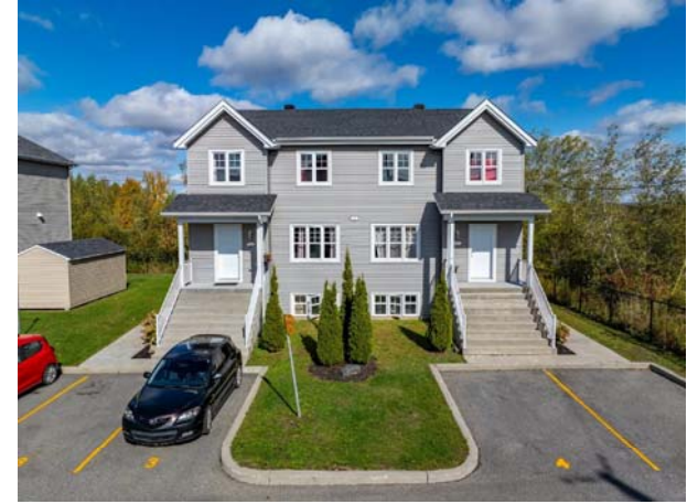
Lemieux 16 - 03