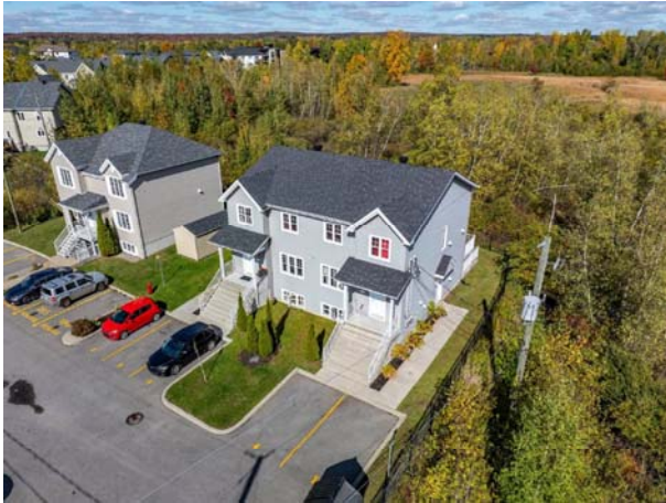
Lemieux 16 - 04