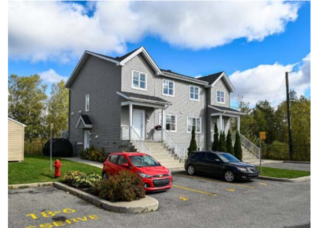
Lemieux 16 - 06