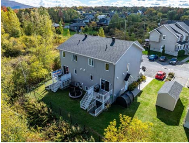
Lemieux 16 - 01